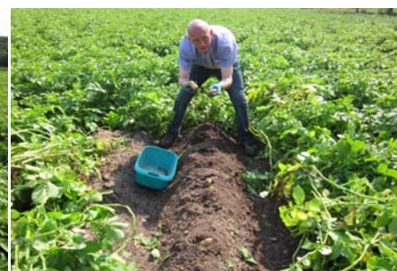
Sampling at the Moor field