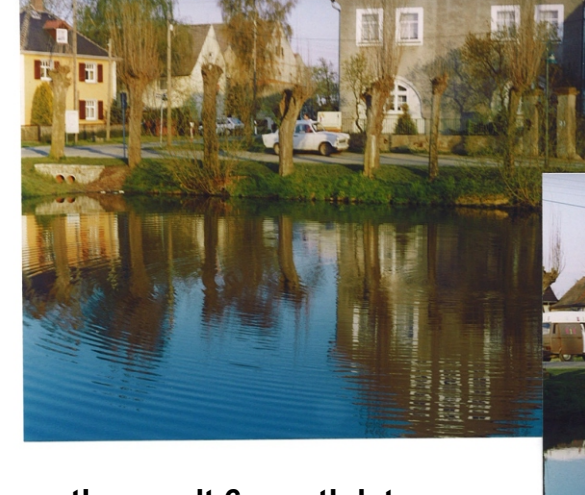
the result 6 month later success lasted over the whole year