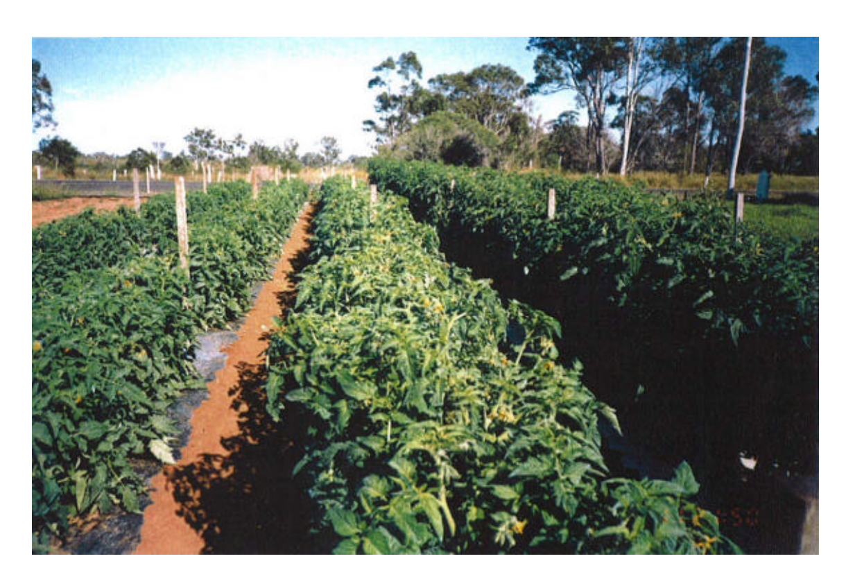
Tomatoes - 6, 8 and 10 weeks

We found with the tomato plants, the stem was a lots tronger than the tomatoplants grown without the Bio Active Plant Strengthener and also had a very strong, huge root system.