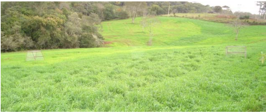
Pasture least developed near forest and further developed on the opposite right side