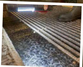
Better manure homogenisation due to increase of aerobic activity, from BioAktiv

Hein Houbraken treats manure daily via BioAktiv additive in the liquid feed