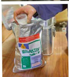
BioAktiv Salis as a feed additive